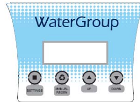
Figure 1. Key Pad Configuration